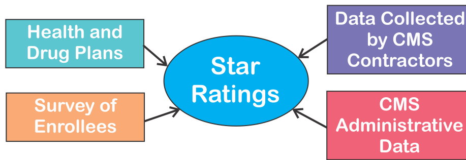
Figure 2: The Four Categories of Data Sources