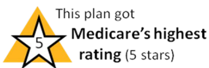
Figure 3: The High Performing Icon

A contract may receive a high performing icon as a result of its performance on the Parts C and/or D measures. The high performing icon is assigned to an MA-Only contract for achieving a 5-star Part C summary rating, a PDP contract for a 5-star Part D summary rating, and an MA-PD contract for a 5-star overall rating. Figure 3 shows the high performing icon used in the MPF: