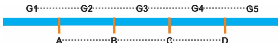
Figure K-1: Diagram showing gaps in data where cut points are assigned

For Star Ratings, the algorithm is run with the goal of determining the four cut points (labeled in the Figure K-1 below as A, B, C, and D) that are used to create the five non-overlapping groups that correspond to each of the Star Ratings (labeled in the diagram below as G1, G2, G3, G4, and G5). For Part D measures, CMS determines MA-PD and PDP cut points separately. All observations are included in the algorithm, with the exception of any data identified to be biased, erroneous or excluded by disaster rules. The scores are grouped such that scores within the same Star Rating category are as similar as possible, and scores in different categories are as different as possible.