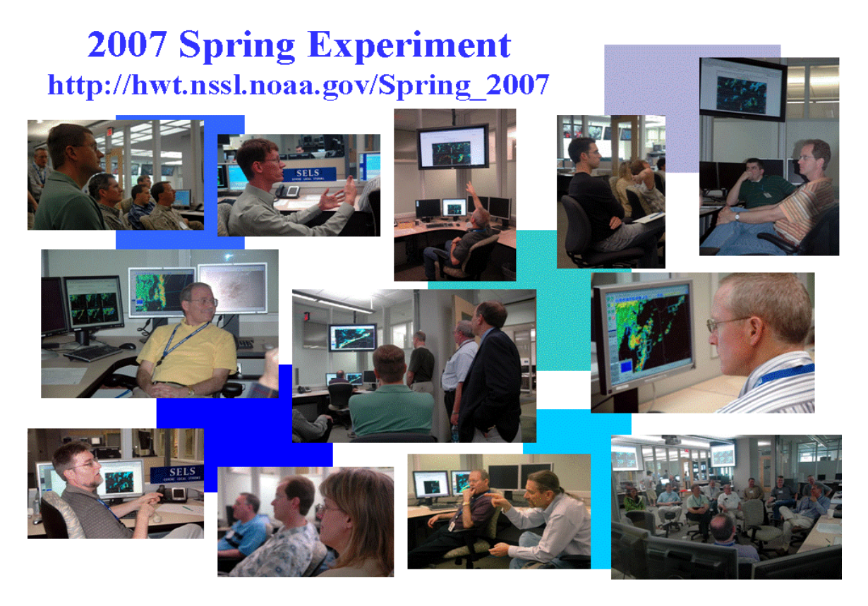
Fig. 1. Assorted pictures from daily activities during the 2007 HWT Spring Experiment.

The EFP conducted a major collaborative Spring Experiment in which organizers from the SPC (NOAA/NWS/NCEP/Storm Prediction Center) and the NSSL (NOAA/OAR/National Severe Storms Laboratory) partnered with scientists from CAPS (University of Oklahoma's Center for Analysis and Prediction of Storms), NCAR (the National Center for Atmospheric Research), and EMC (the NOAA/NWS/NCEP/Environmental Modeling Center). The Experiment was conducted from April 19 through June 8, Monday-Friday in the HWT. It drew strength from the participation of a broad spectrum of individuals, including a total of 63 research scientists, forecasters, university faculty, graduate students, and administrators from government agencies, academia, and the private sector (see Fig. 1 for assorted snapshots of daily activities and the appendix for a complete list of participants). Most participants spent an entire week in the program and many external visitors presented seminars to the