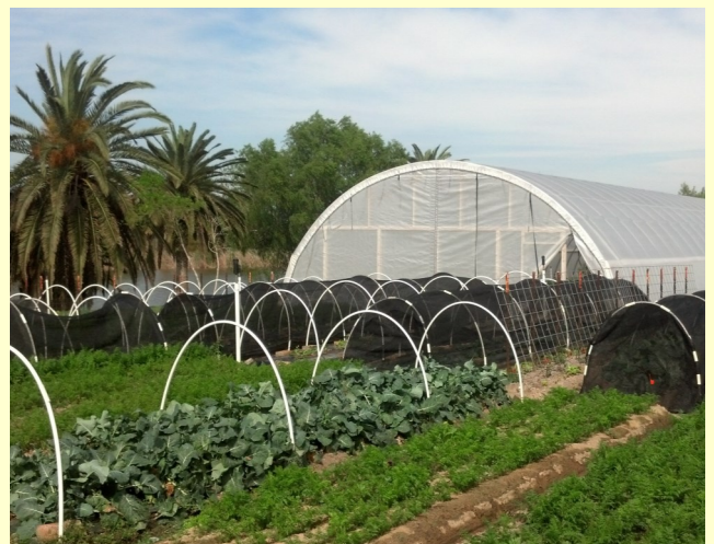
Above: Acadia Farms in Bayview.

Susanne: “No freezes, so it was a good winter as far as moderate temperatures go, but wish there had been a few more sunny days.”