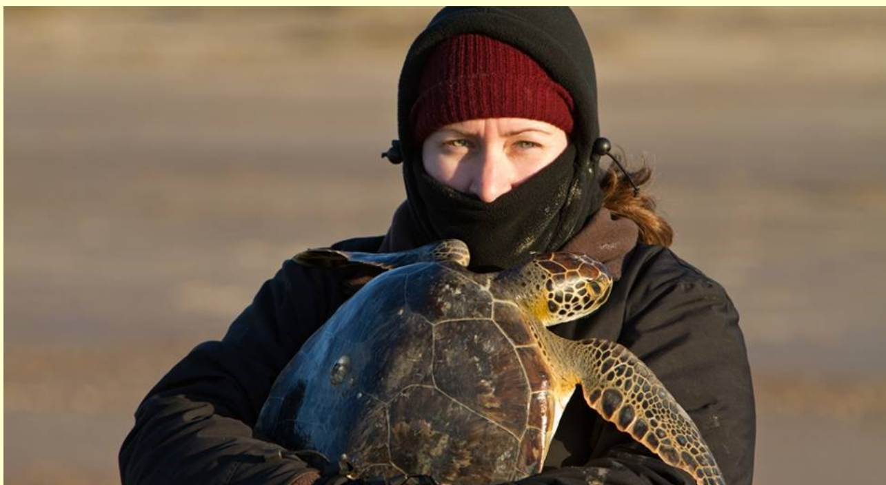
Above: A turtle being rescued by Sea Turtle Inc.

If you'd like to help Sea Turtle Inc. with their rescue efforts, visit them online at: www.seaturtleinc.org .