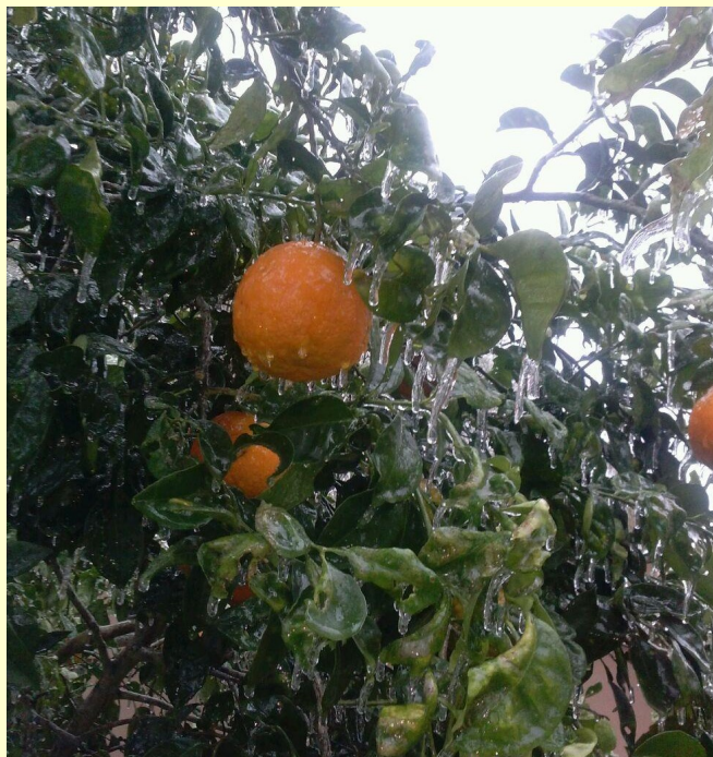
Above: Glaze on an orange tree in Bayview on January 29, 2014.