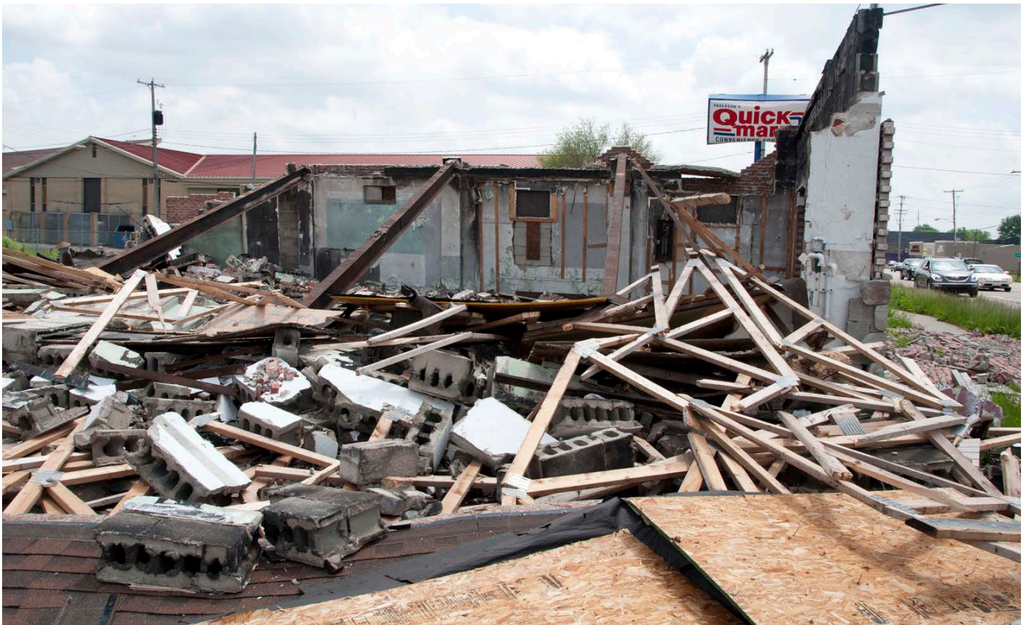
Destruction from a May 2013 Tornado in Genesee County

Tornadoes generally travel from the southwest at an average speed of 30 mph. However, some tornadoes have very erratic paths, with speeds approaching 70 mph.