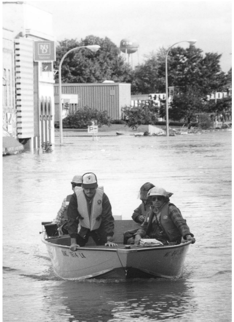
2016 marked the 30th anniversary of Michigan's "Great Flood". Pictured above shows overrun from the Cass River in Vassar, MI.

On October 17-18, heavy rainfall of three to four inches fell on top of already saturated ground in Marquette, Dickinson and Iron counties in the Upper Peninsula. This generated flash flooding that washed out numerous roads, closed some buildings, and damaged some homes. The flooding caused over $2 million in damages. In Marquette County, flooding along Green Garden Road necessitated water rescues by firefighters and EMS personnel. Ten people and four pets were rescued from the flood waters.