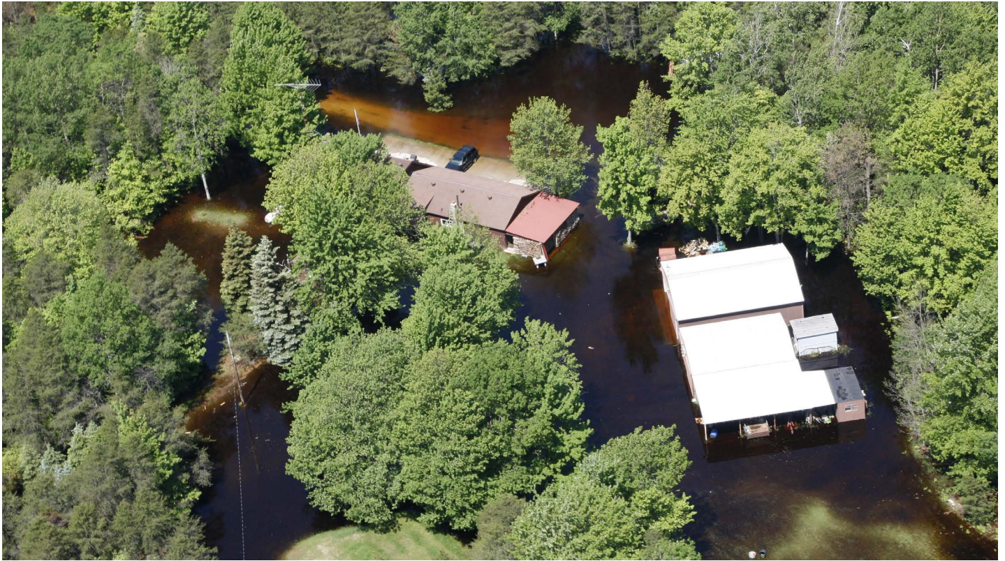
Mason County Flooding in June, 2008

To help calculate flood damage that could occur to your home, visit www.floodsmart.gov and click on the link to learn more about "What Could Flooding Cost Me?"