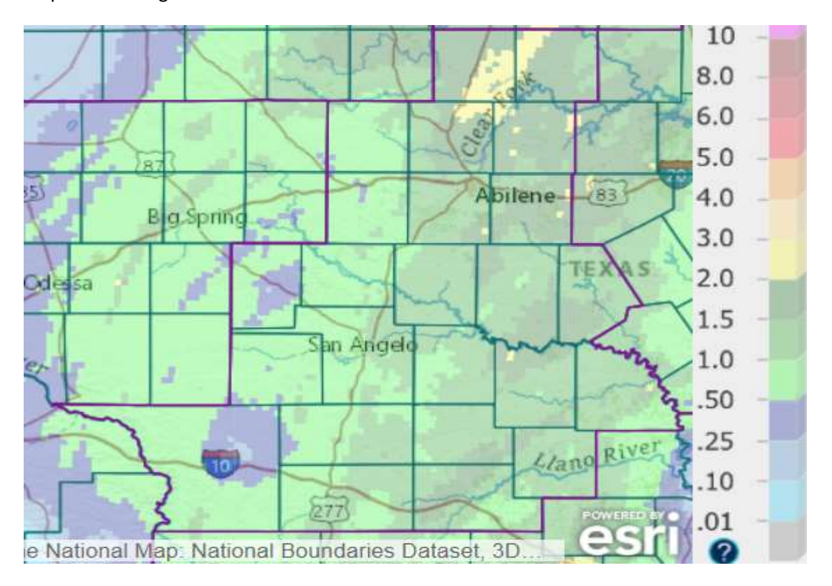
Figure 3: Rainfall for the 7-day Period ending at 6 AM, Jan. 19.

numerous showers and a few thunderstorms on Jan. 16. Some light freezing rain occurred across the Big Country on the night of Jan. 16, as temperatures dropped to or just below the freezing mark. Minor ice accumulations were reported in trees and elevated objects across parts of the Big Country north and west of Abilene. Temperatures climbed into the 50s the following day on the 17<sup>th</sup>, and additional showers occurred across west-central Texas. Total rainfall for Jan. 16-17 is captured in the 7-day rainfall map shown in Figure 3.